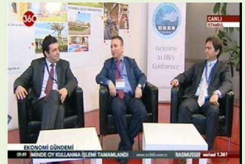
13th EBES Conference live on national TV.