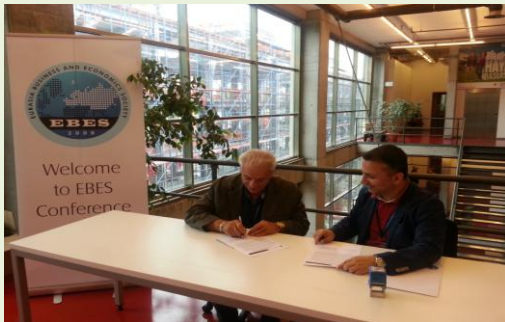
EBES has signed collaboration agreement with Russian Academy of Sciences