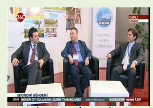
13th EBES Conference live on national TV.