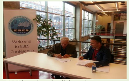
EBES has signed collaboration agreement with Russian Academy of Sciences