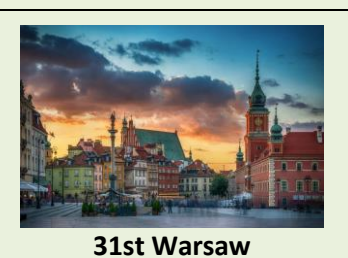
April 15-17, 2020